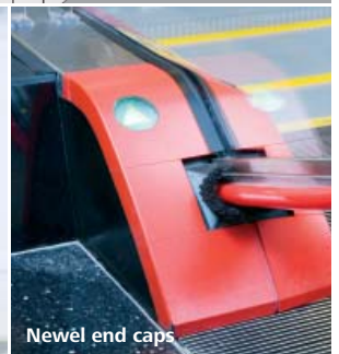
Newel end caps