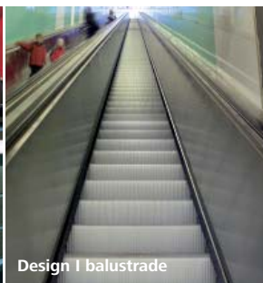
Design I balustrade