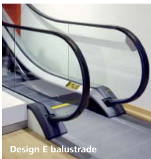
Design E balustrade