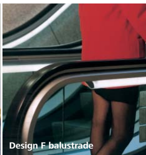
Design F balustrade